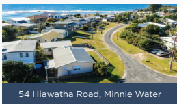
54 Hiawatha Road, Minnie Water