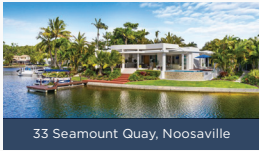
33 Seamount Quay, Noosaville